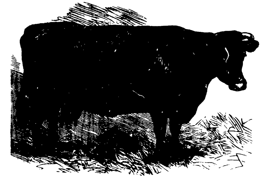
CHAMPION MILKING SHORTHORN COW RED CHERRY.

B. B.-Did you ever try judging by points?