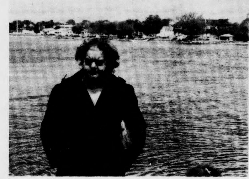
Come to 111 Central Square on Thursday, July 4 at High Noon for The First Big Summer Staff Meet.

When journalism is your only hope, don't be caught with your back to the water. There are others just like you at Excalibur. When it gets down to sink or swim, come on over and rake mud with the friendly Excalibur staff.