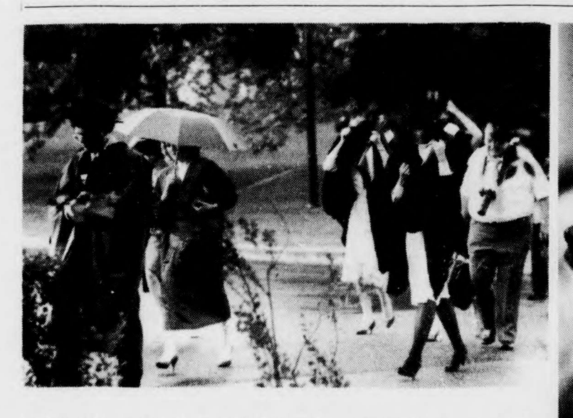
CLASS OF '85: Rain didn't deter this procession of graduands and the press to convocation ceremonies. At right, a squirrel secretly aspires to higher education beneath the hat of an unsuspecting graduand. Similar attempts by elephants and hippos were not quite so successful.