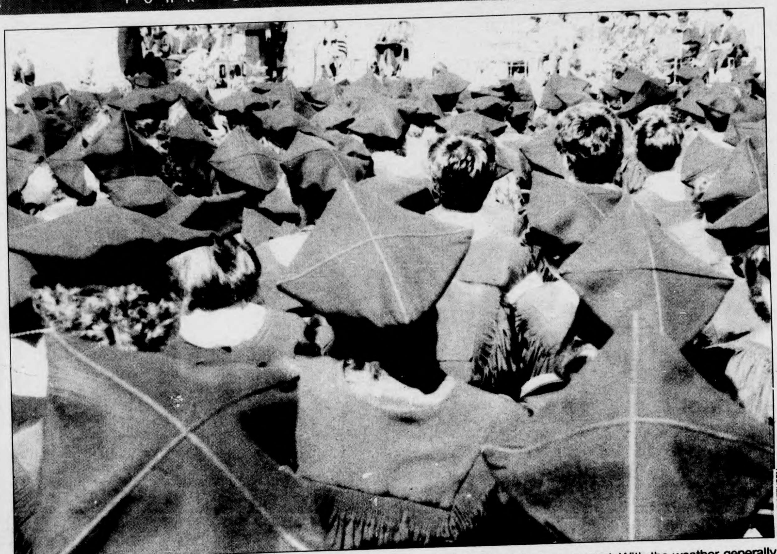
A SEA OF HATS: This scene was repeated several times last week as over 3,800 students graduated. With the weather generally cooperative, the ceremonies were held at the top of the Ross Building ramp. A lone bagpiper commenced each ceremony.