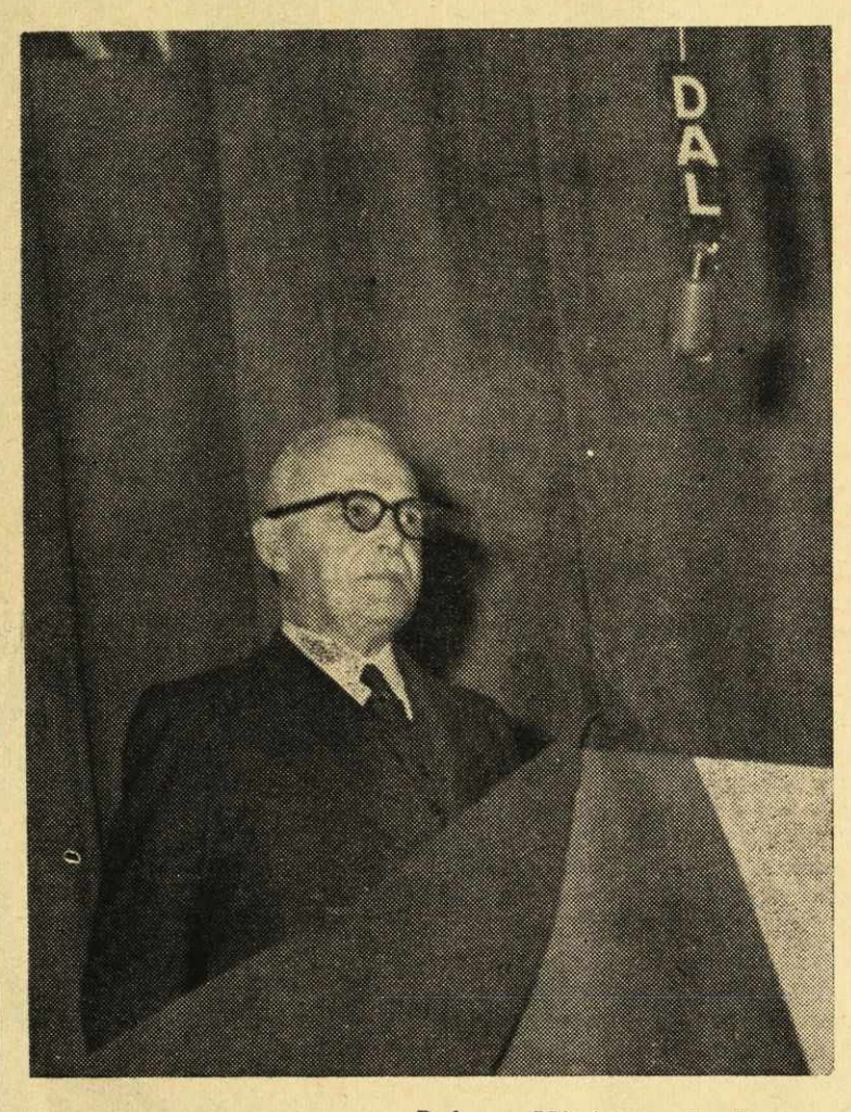
. . . Prime Minister St. Laurent