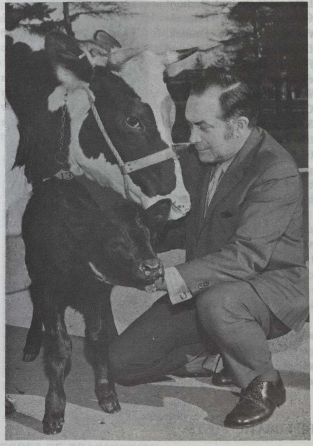
Agriculture Minister H.A. Olson greets Tulip, the embryo-transplant calf, while the proud "foster mother" looks on.

"At least three main hurdles exist," they stated: "First, hormonal methods of superovulating donor cows can still produce unpredictable results. A more consistent method must be found to produce about ten eggs at one time. "Secondly, we need to have the estrous cycles of the donor and recipients synchronized so that all ovulate at the same time. This is essential to the continuing development of the fertilized egg in the host cows. "Improvements in methods of storing fertilized eggs after collection until they are transplanted might eventually overcome this difficulty."