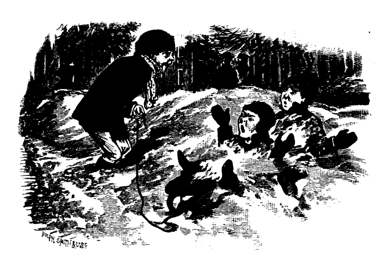
{\bf Apropos} \ \ {\bf of} \ \ {\bf the} \ \ {\bf late} \ \ {\bf trouble} \ \ {\bf on} \ \ {\bf the} \ \ {\bf Grand} \ \ {\bf Trunk} \ \ {\bf Railway}: - Big Boy--'' I guess I'll strike here."