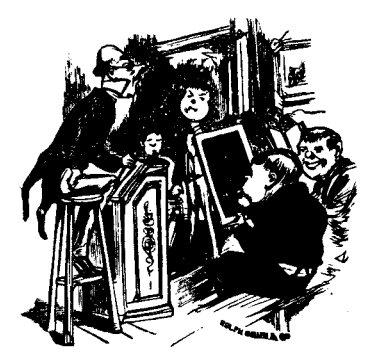
"Oh Happy time, Art's early days."--Hoob.