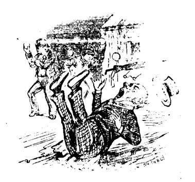
"Now is the winter of our discontent." -- Shak - Peare.