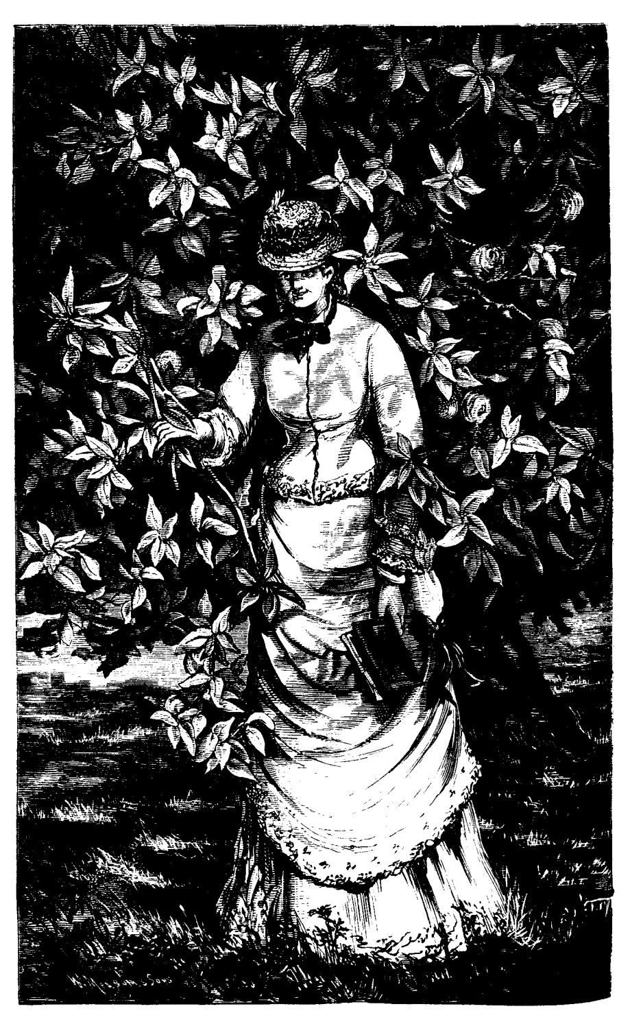
"LA RUSE D'AMOUR!