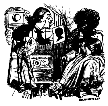
"Tais faint resemblance of thy charms. Tabugh strong as mortal art could give."—Byros.