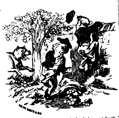
""TIs sweet to hear the watch-dog's honest bark." ---BYRON.