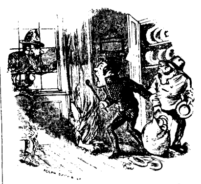
But soft! what light through yonder window breaks? -Shakspeare.