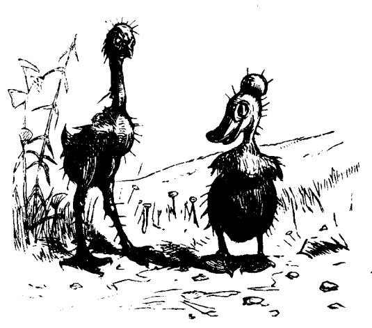
"Weepsey and Wopsey."