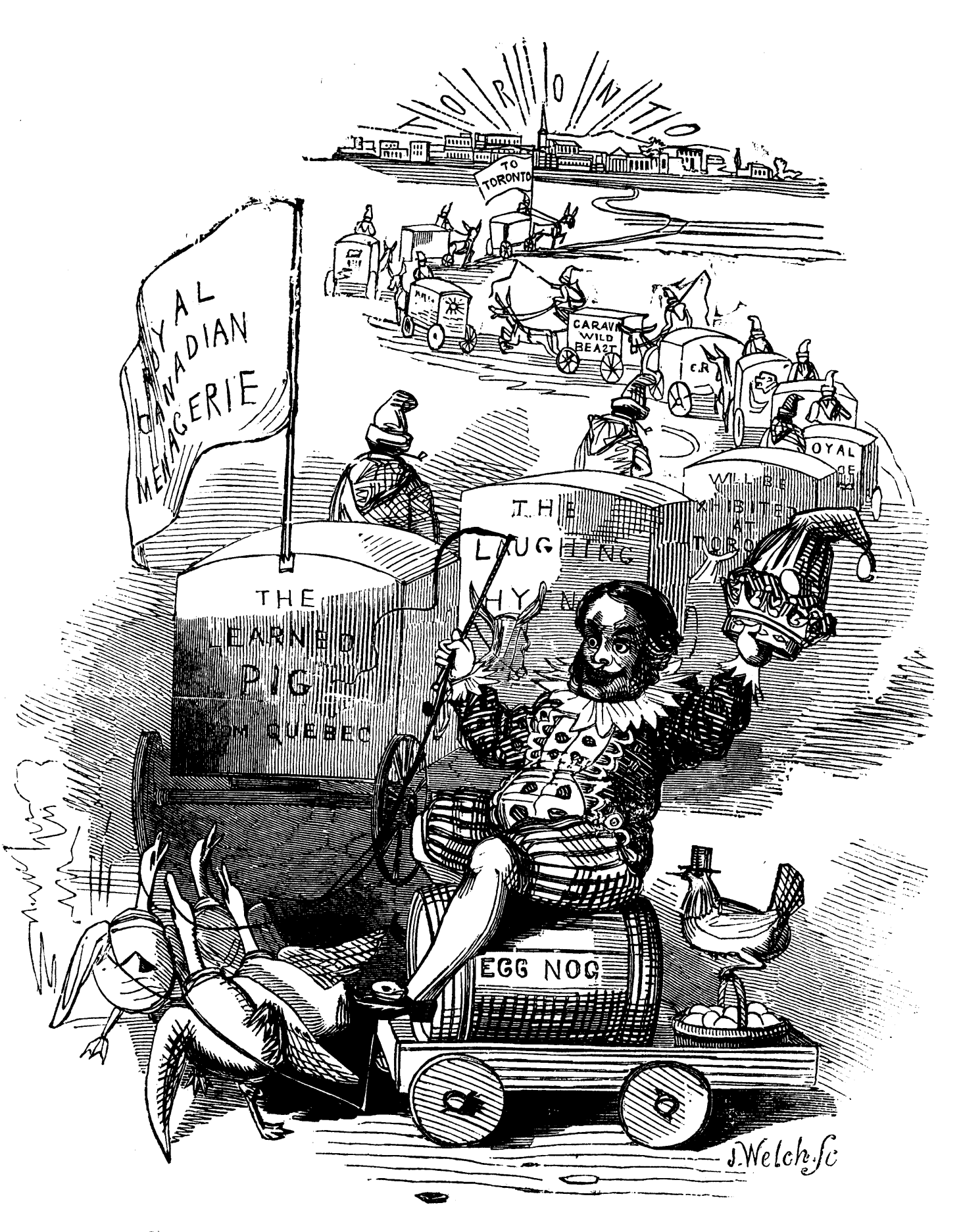
CLOWN LOQUITER.—Here we go, and here we are.