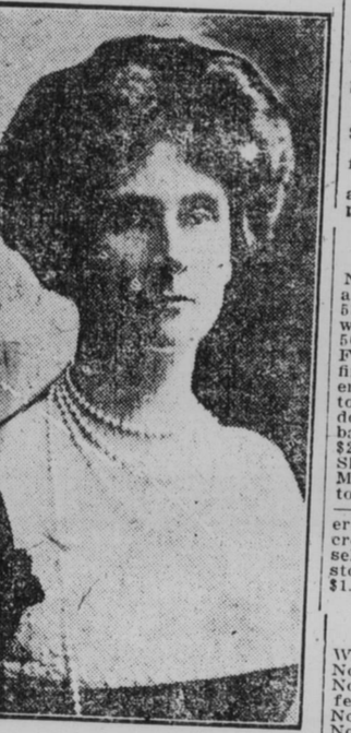
DUCHESS OF DEVONSHIRE.