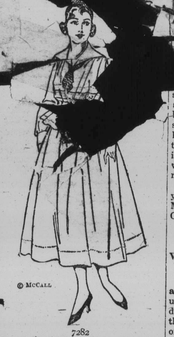
Pongee Frock with Slip-On Blouse

also in white. It is a practical fabric, too, as it sheds dust, does not wrinkle readily, and launders perfectly. Coats and blouses, too, for wear with skirts of linen, the corded cottons, or the regulation suit skirt of serge or gabardine, are being fashionably revived for evening and the more elaborate afternoon dresses. Separate Coats and Skirts How the separate skirt could ever have been laid aside for a season or ed of wash satin, most effectively. A tennis coat, in Norfolk fashion, a belted Russian, or one of the various other peplum model, developed in a soft tone of satin, may be worn for morning, sports wear, or for afternoons. The sheer linens, cottons and silks