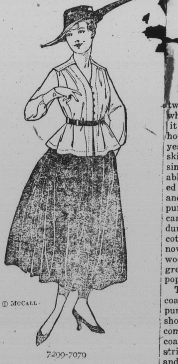
Pink Organdy Blouse, Black Satin Skirt.

With the first, sultry days of summer, one naturally turns to white, or the pale-toned linens and cottons. Owing to the popularity of stripes and checks, it is safe to say that it will not be an all-white season, but all-white is to be very popular, nevertheless. Wash Satin in Suits and Dresses One of the coolest and most novel of the new summer materials, both for suits and dresses, is wash satin. This comes in the plain flat tones and