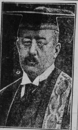
DUKE OF DEVONSHIRE.