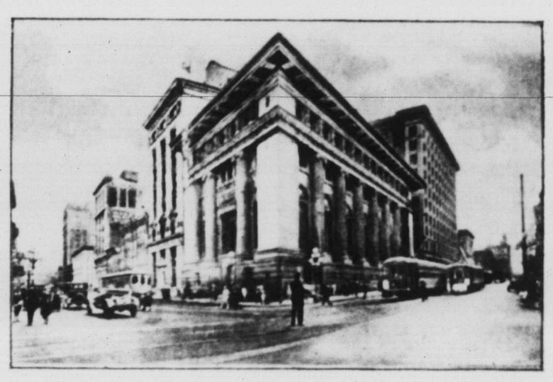
CORNER OF GRANVILLE AND HASTINGS STREETS, VANCOUVER, SHOWING CAN-ADIAN BANK OF COMMERCE, ROGERS BUILDING, ETC.