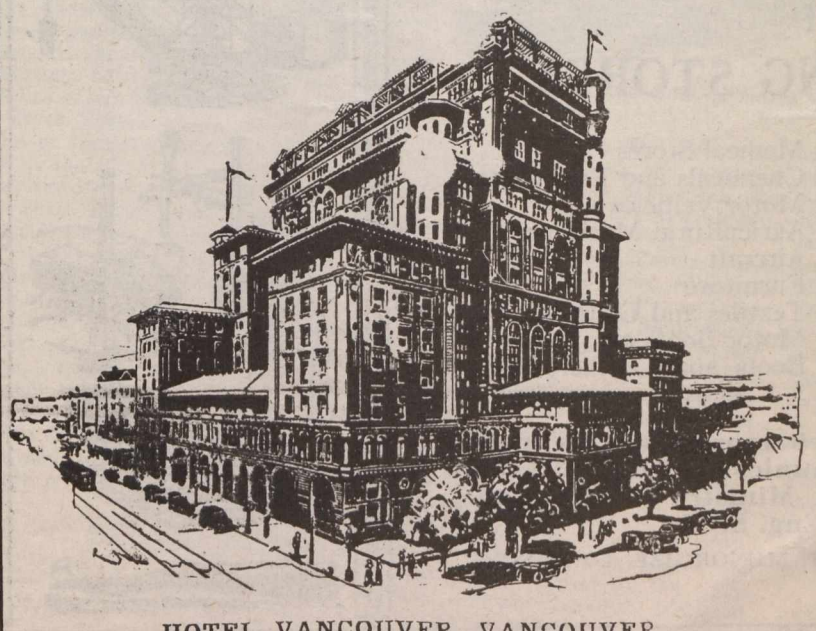
HOTEL VANCOUVER VANCOUVER