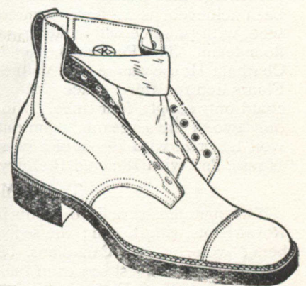
"K" Service Boot

Campaign, Riding, Dress and Long Boots always in stock, in sizes and half sizes