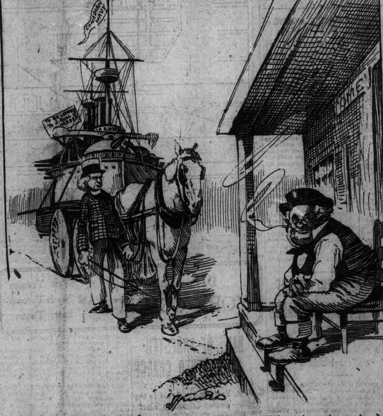
MR. BULL. Do me hies deceive me, or is this 'ere our Willy with another on 'em?