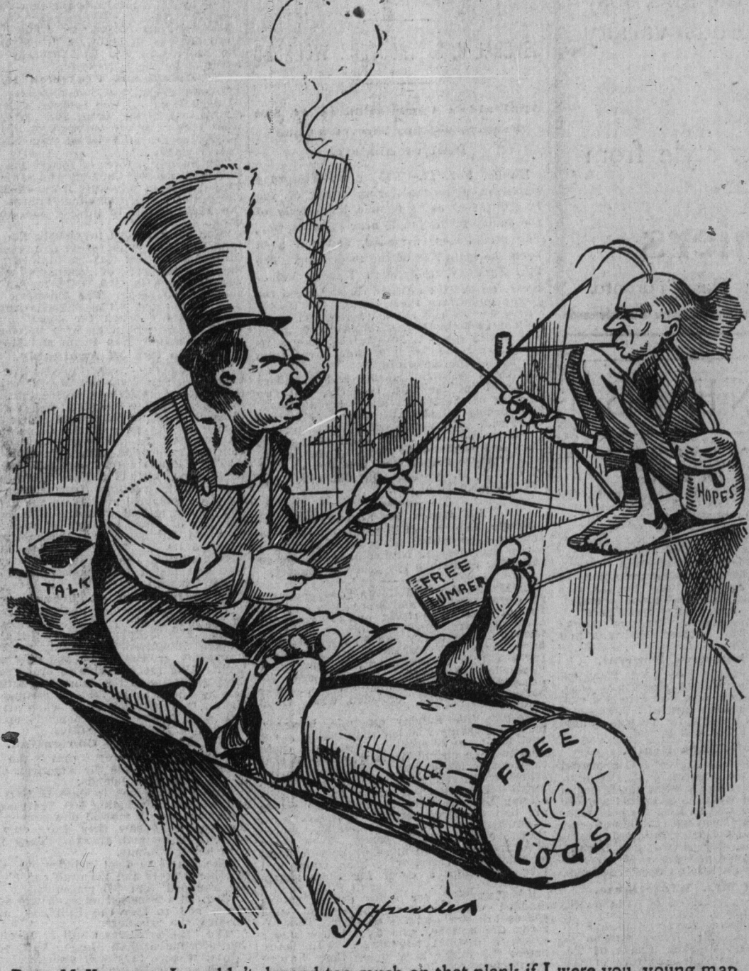
BULLY MCKIMLEY: I wouldn't depend too much on that plank if I were you, young man. WILF LAURIER: It's about as safe as that log, anyway.