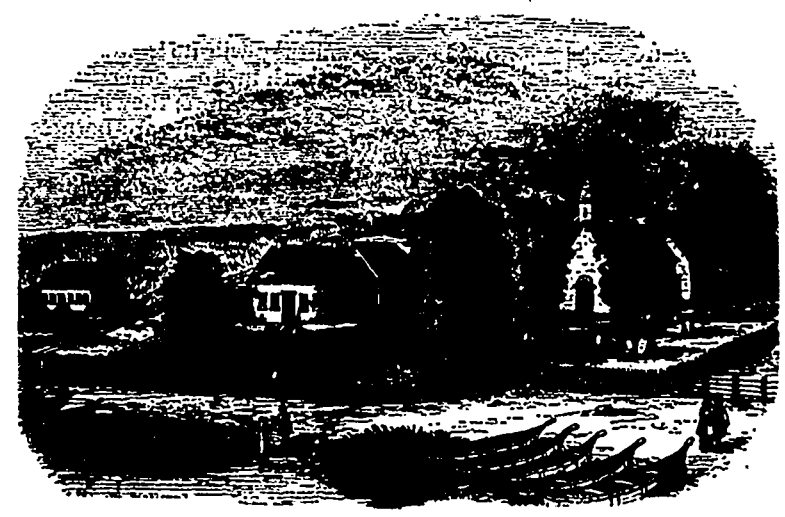
RED RIVER SETTLEMENT .- See page 102.

of existence, and he cannot be absorbed into other nations; so that he is and always will be the great incontrovertible fact that infidels can never do away with.