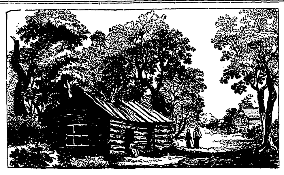
THE LOG HOUSE IN THE BUSH.