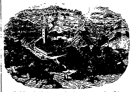
so called from its dark waters), where was a garden :" it was on the western side of the Mount of Olives. Gethsemane

Notes and Comments.-Ver. 32. "Gethsemane:" John says (18: I), "over the brook Cedron (black brook,