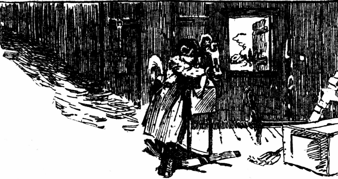
"BE SORRY FOR ME, BRUND." PLEADED PINK, HIDING HER FACE IN HIS SCANTY MANE.