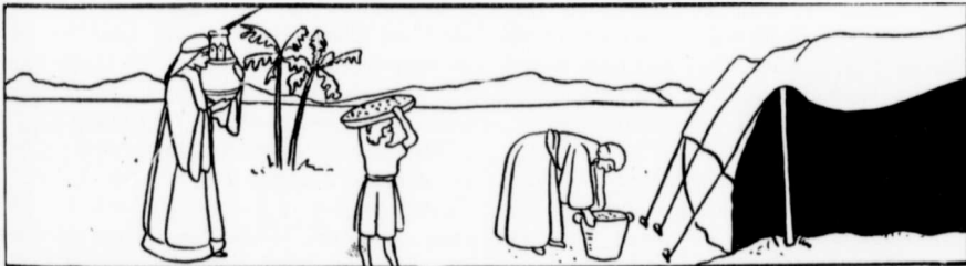
Here is a little boy helping two older people to gather the manna. God was thinking of the little ones when He sent the food from heaven. Color the picture.