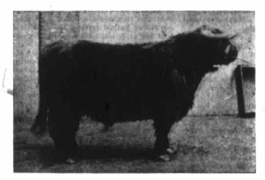
Highland Steer, owner and breeder, H.M. the King, Sandringh age 3 yrs. 10 mos. 5 days; weight, 15 cwt, 0 qrs. 15 lbs; reserve for Breed Cup, Smithfield, 1992.