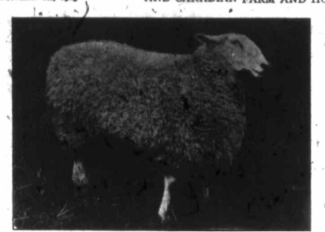
A Shearling Leicester, owned by Hastings Bros., Crosshill, Ont.