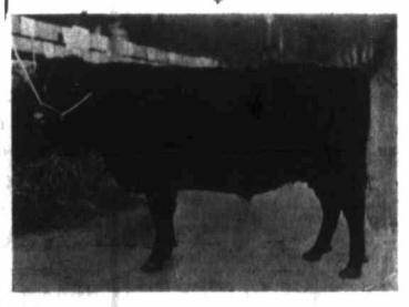
d Hall Steer, Owner and breeder, H.R.H. Prince of Wales. Sa iring ham; age 2 yrs. 7 mos. 3 wks. 4 days; weight 13 cwt. 2 grs. 21 lbs. First prize and reserve for Red Poli Cup. Smithfield, 1992.