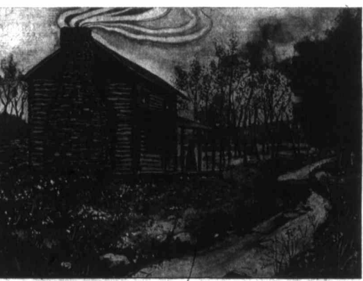
The "Old Homestead," from Colin of the Ninth Concession.