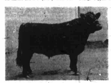
way Steer, "Punch." Owner Captain A. Stirling, Kier Du. e. Perth, Scotland; age 1 yr. 10 mos. 4 days; weight, 11 cwts. 1781, 10 lbs. First and reserve for breed our. Smithfield 1991.

The following summary furnishes a comprehensive view of the changes in the principal agricultural features of