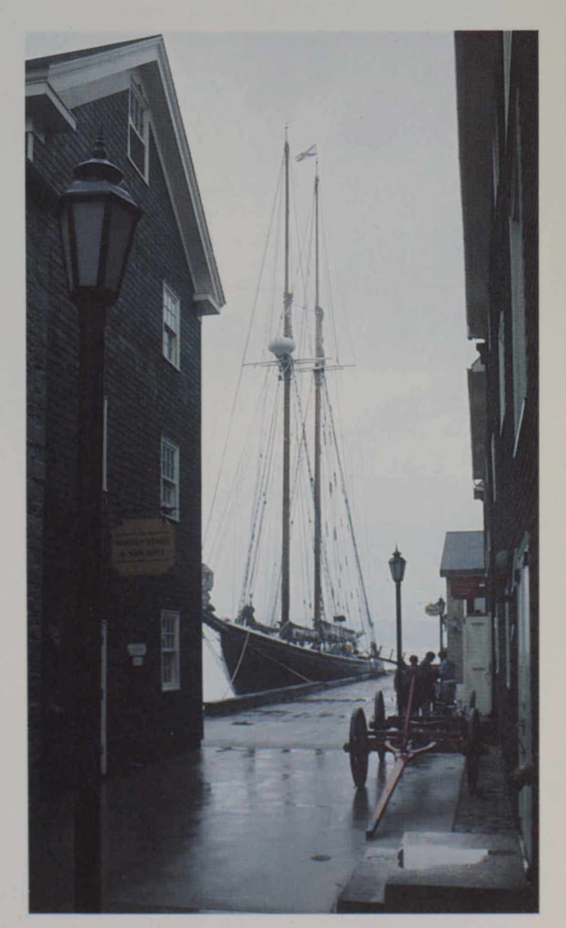
The Bluenose II, from A Basket of Apples.

ing, dying, and thriving on the dark ocean. Even the folklore of islands looks seaward, toward eerie lights and apparitions, the wails of the longdrowned, wandering ghost ships, and blazingphantom ships. Islands tend to be a shade more spooky. . . . "