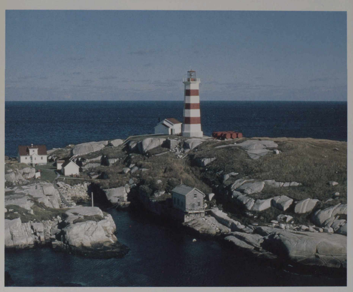
Entrance to Halifax harbour.

Nova Scotia has long seemed to its ardent admirers to have almost everything.