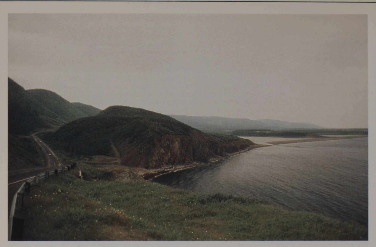
Cape Breton Highlands National Park.

the tip of the point, on top of the southern coast at the mouth of the St. Lawrence, was the centre of a small world. A thriving town surrounded the cemetery, but the automobile arrived and the living drove away and left the dead behind.