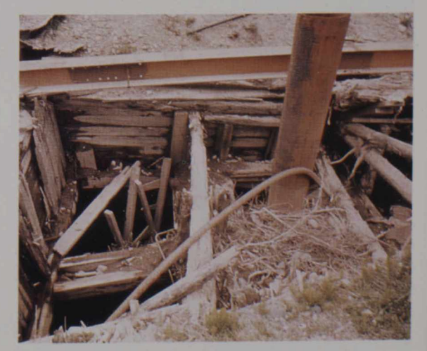
Oak Island treasure shaft.

St. Margaret's Bay is northeast of Mahone, and Peggy's Cove is out on the edge of its rocky shore where the bay meets the Atlantic. It has been a fishing village since 1811, but it is obvious that mankind has had only a minor impact.