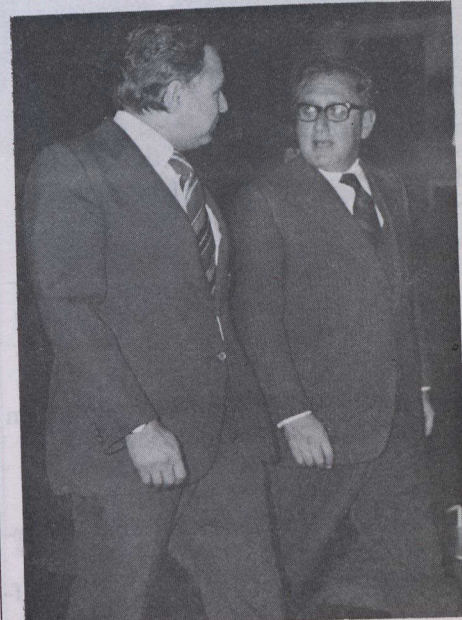
Secretary of State for External Affairs Allan J. MacEachen (left) and U.S. Secretary of State Henry Kissinger on arrival in Ottawa, October 14.

The Secretary: "There is no country with which we have closer ties and