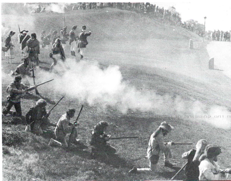
Fire! Fire! Fire! Despite blank cartridges, both Canadians and Americans took the historic replay of the 1775 Plains of Abraham skirmish seriously. Drummer boys and wounded soldiers all played their parts.