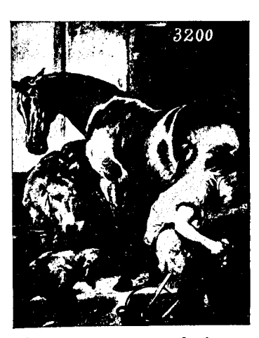
SHOEING THE BAY MARE—Landscer

We have a splendid assortment of School Pictures. Let us send you some on approval. Write for particulars.