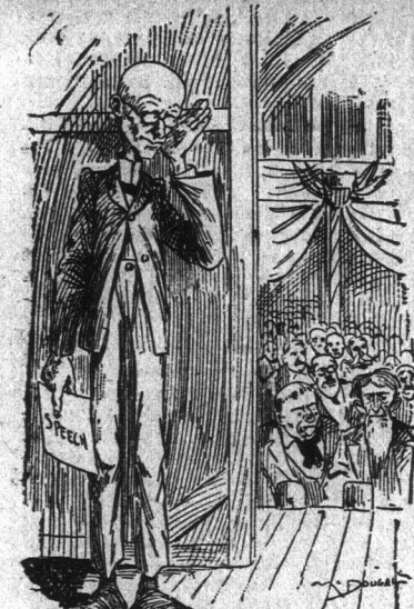
WAITING THE CONVENTION'S CALL.