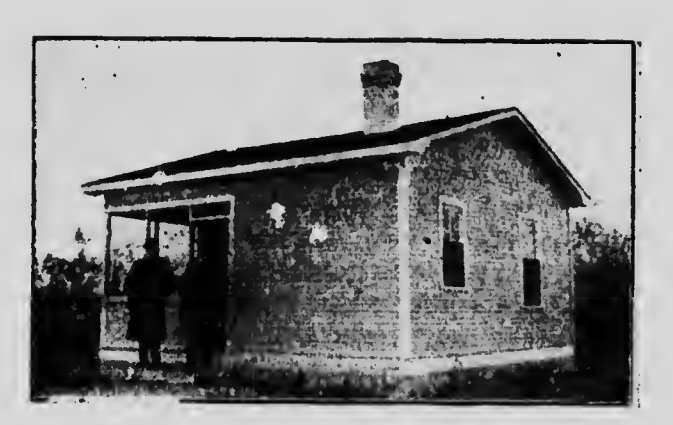
HAZEL GLEN SCHOOL RESIDENCE