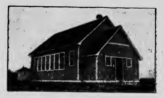
HAZEL GLEN SCHOOL