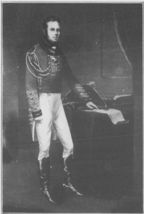
SIR GEORGE PREVOST