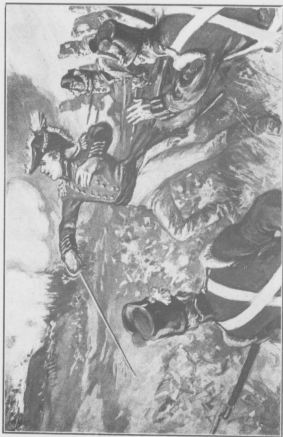
THE DEATH OF BROCK