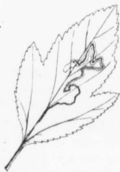
Fig. 7.—Mine of N. opulifoliella .

Eleven specimens bred from mines on Opulaster ( Opulaster opulifolius (L.) Kuntze) at Cincinnati. The mine is a narrow linear brown tract with a dark line of frass running through it. The cocoon is reddish brown, its anterior end broader and flattened. On July 13th the larvæ were nearly full-fed, and all pupated within a few days. The imagoes appeared July 29th to August 4th.