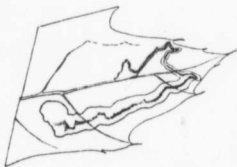
Fig. 8.—Mine of N. terminella .

The mine is a pale greenish gradually broadening linear tract, 3.5 mm. wide at the end, with a blackish line of frass through the centre. Larva yellow even when very young; thus this mine can early be distinguished from the other linear mines on oak. Cocoon brownish ochereous, obovoid.