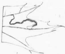
Fig. 2.—Mine of N. latifasciella .

mm. in width. At first the frass is deposited in a broad line through the centre, later scattered across almost the entire breadth and toward the end of the mine collected in a broad band. On red oak, the mine measures approximately 5 cm. in length; on scarlet oak, it is much shorter, often not exceeding 3 cm. The larva is