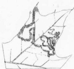
Fig 6—Mine of N. altella .

The mine is placed on the lower side of the leaf and is very much contorted, winding back and forth, the bends almost con-