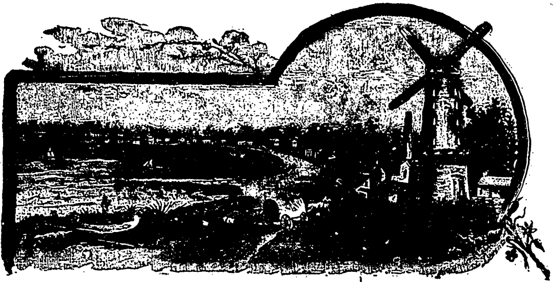
TORONTO IN 1834.