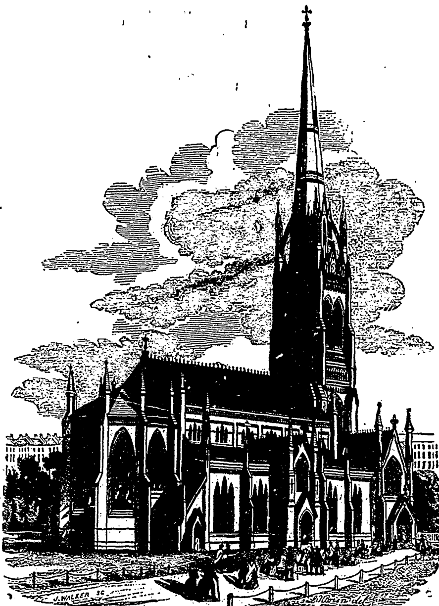
ST. JAMES' CATHEDRAL, TORONTO, 1886.

AT THE close of one of the Missionary Meetings of the C. M. S., a gentleman said to a speaker, "I liked your speech; it went home, and I am going to double my subscription." "That's right," was the reply; "you will not miss it." "No," said he, "I have plenty more." "Then," was the answer, "you had better begin at once to give what you will miss." And this is what we all should do.