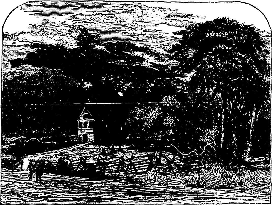
FIRST ST. JAMES' CHURCH, TORONTO.