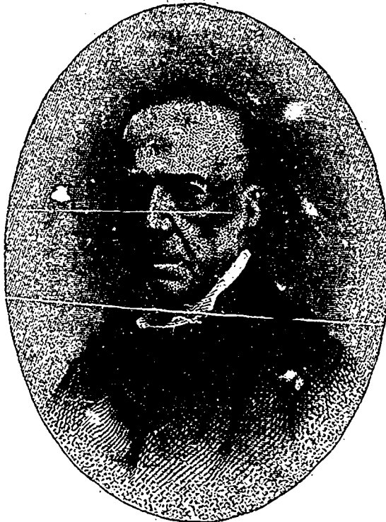
HON. AND RT. REV. JOHN STRACHAN, D.D., LL.D.

The early history of the church in Upper Canada is connected closely with that of the resolute and distinguished Scotchman, John Strachan, first bishop of Toronto, who was induced to leave his native land, as a young man, of education, to undertake the training of the youths of Canada—a subject which was causing considerable anxiety to many leading families of the colony, such as the Hamiltons, the Stuarts and the Cartwrights. Mr. Strachan arrived here, as he himself used to say, "on the last day of the last month, of the last year of the last century." His career began here with the present century.