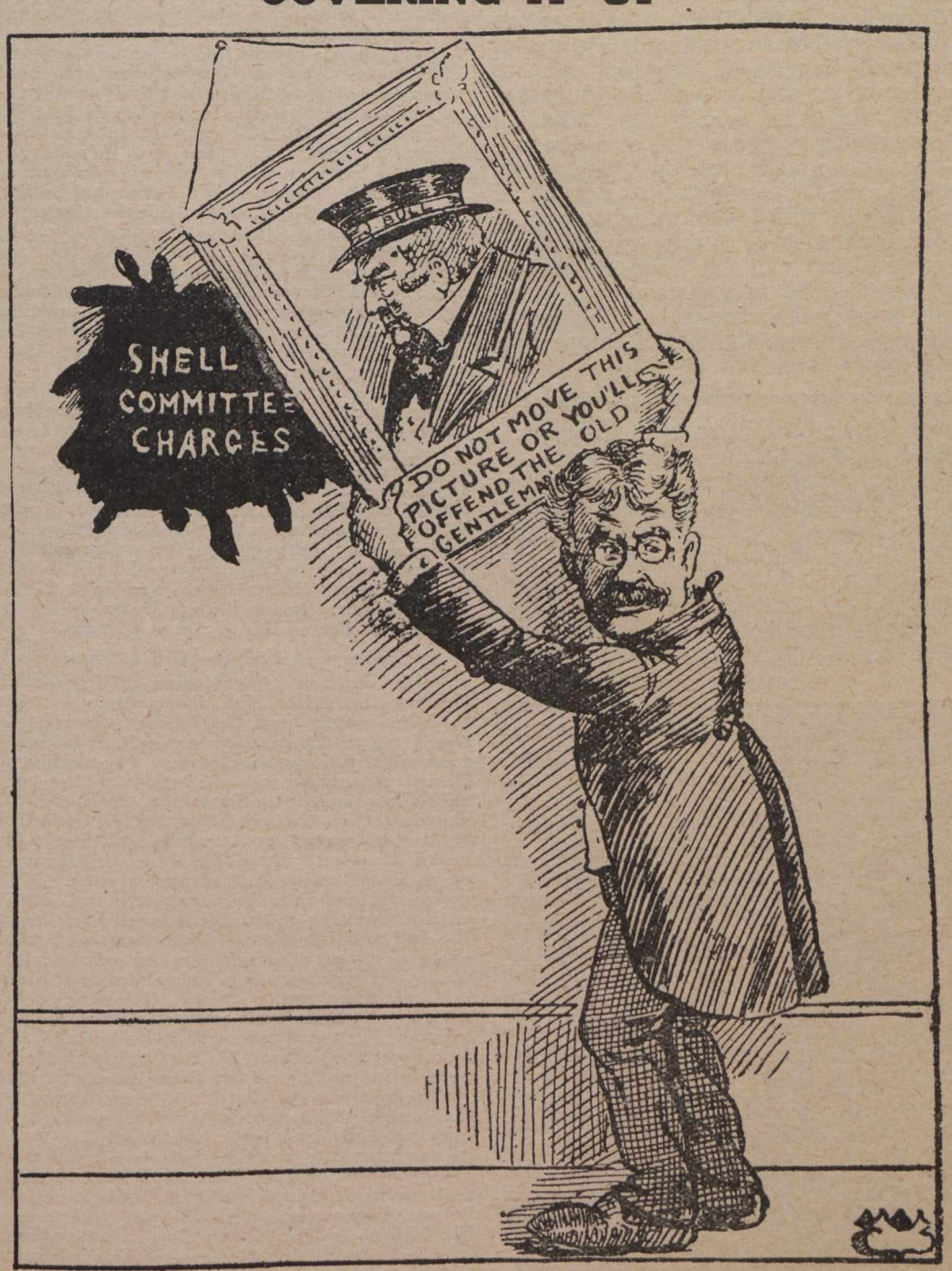
SIR ROBERT BORDEN—"They can't see that Black Spot on the wall if we hang the Old Man's picture in front of it." (From the Toronto Telegram, Conservative).