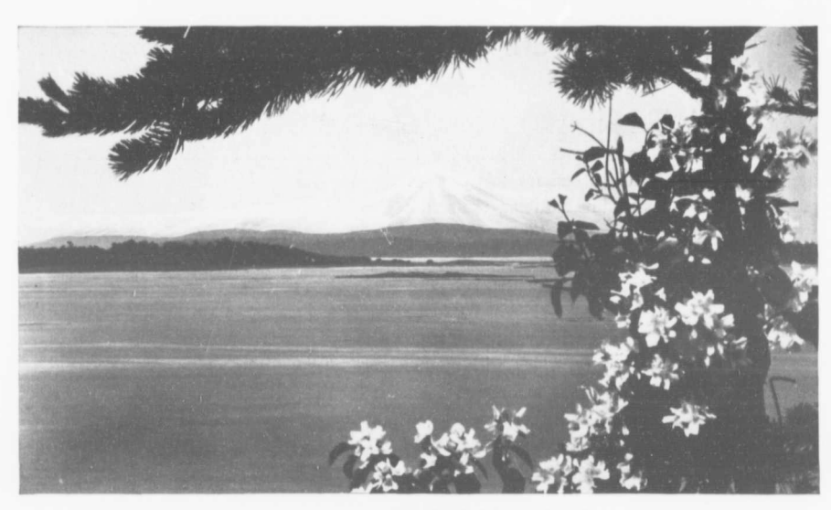
VIEW FROM GOLF LINKS PARK, "ONE OF THE MOST BEAUTIFUL IN THE WORLD."