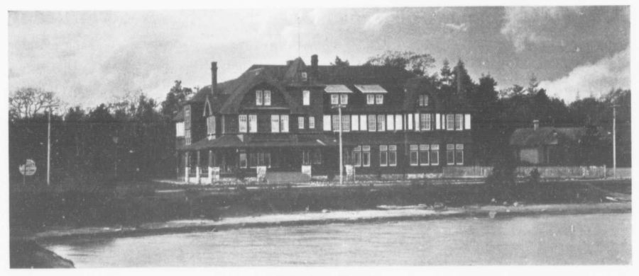
Oak Bay Hotel

This unique "Old-English-on-the-shores-of-the-Pacific" hotel is the centre of the social life of Oak Bay, and has always been a most powerful influence in the development of the district. It is more like a private club than hotel, and has always been closely identified with the success of the Golf Links. The hotel is five minutes walk from Golf Links Park.