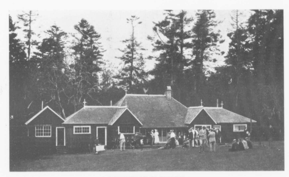
CLUB HOUSE, OAK BAY GOLF LINKS