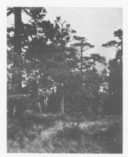
JUST SUFFICIENT SHADE TREES TO ADD TO ITS BEAUTY

The vendors have placed adequate building restrictions on every lot of this subdivision to protect purchasers and to insure high-class residences and a desirable class of people. The amount of these building restrictions will be found in the price list attached hereto.