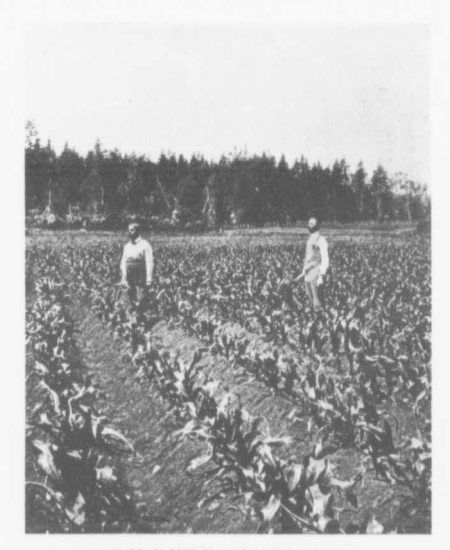
AN IDEA OF SOME OF THE $400 AND $500 LOTS