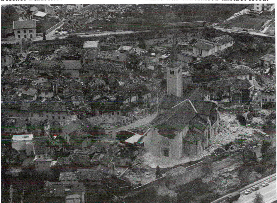
The town of Venzone, one of the Italian communities devastated recently by severe earthquakes in the country's northern region. Some 280

Many of the injured were referred to the Canadian camp by an Italian doctor from Proviono, where the medical clinic was considered unsafe. About