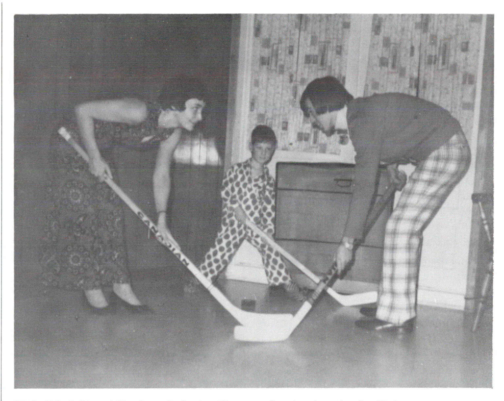
With "SafeTpuck", the whole family can play hockey in the living room.

The present female strength in the CAF is 514 officers and 1,143 other ranks. The new policy will increase the numbers to over 2,000 officers and about 5,000 others. Recruiting of women will start immediately in those classifications and trades where