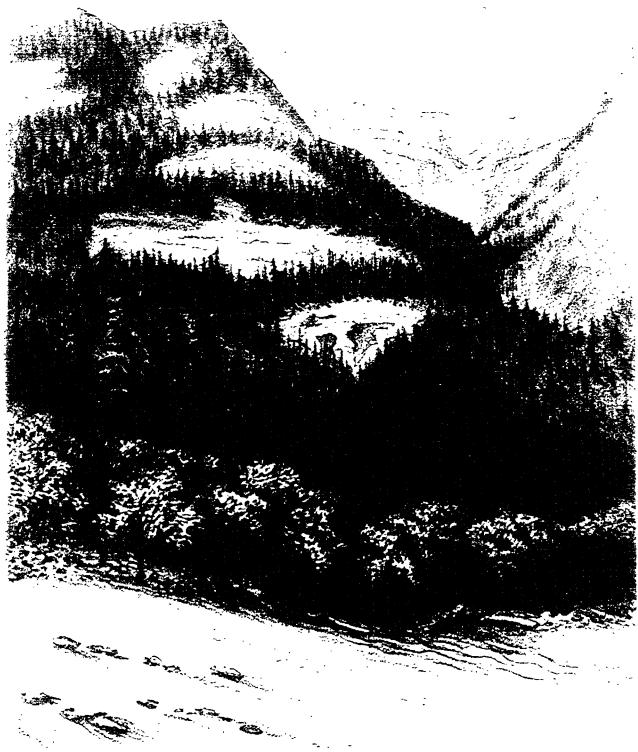
VIEW NEAR SPROAT'S LAKE VANCOUVER ISLAND.