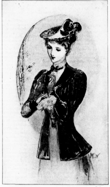
HANDKERCHIEF IN SLEEVE, MILITARY STYLE, 1896.

In the space round the ruddy warmth of the brazier are gathered ten or a dozen workmen, who are each supplied with a tin bottle or can, and on the lap of each is spread a red-and-white handkerchief, containing their mid-day meal. evidently is the correct thing, as every man has the same, and it is also the rule in all the other London laagers. So there are clearly fashions even where red-cotton handkerchiefs are concerned!