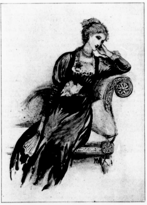
HANDKERCHIEF IN THE GIRDLE.

After this there came a time when the handkerchief was held in the hand; being