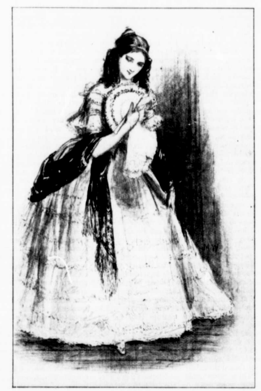
THE HANDKERCHIEF AND FAN, 1847.