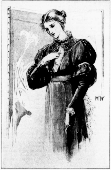
THE PRE-RAPHAELITE STYLE.