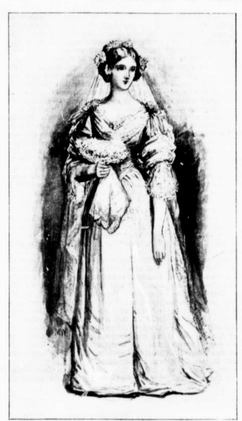
THE HANDKERCHIEF AND BOUQUET IN 1837.

these handkerchiefs is preserved at St. Peter's at Rome, another in Milan Cathedral."