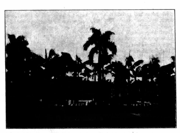
A PLAZA IN LIMA