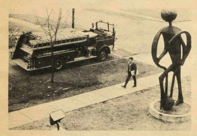
Ding Ding Ding . . . Fzzz