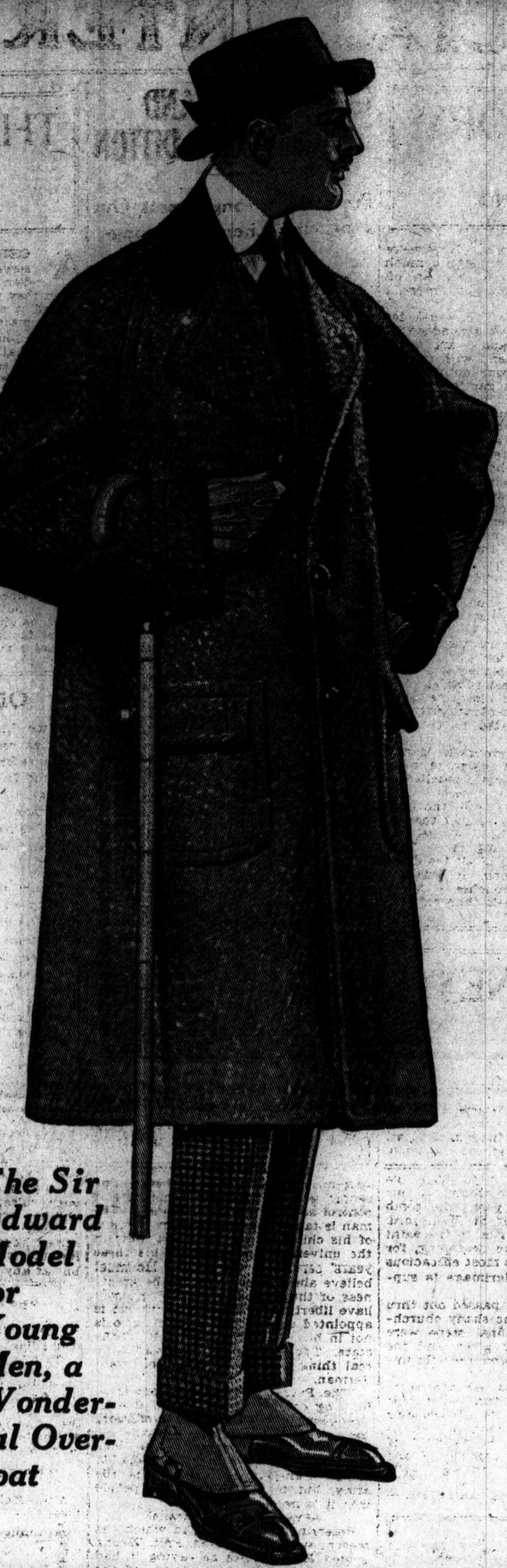
The Sir Edward Model for Young Men, a Wonderful Overcoat