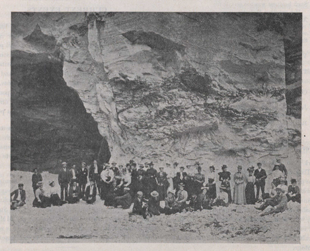
TYPICAL SUMMER SCHOOL GROUP. - PLASTER QUARRIES, ALBERT CO., N. B., JULY, 1898.

in Quebec and north-western New Brunswick. To the south, just back of the town, is Sugar Loaf Mountain, from the top of which one of the most commanding views in northern New Brunswick may be obtained. No more advantageous place could possibly be chosen. The scenery is such as to delight every lover of nature; and to spend two weeks amid such scenes and in a cool and invigorating atmosphere will refresh and delight many tired spirits. The student of natural science will here find unequalled opportunities for investigation. Geologists and botanists will have before them one of the most interesting districts in Canada for exploration. The zoologist will have abundance of marine and fresh.