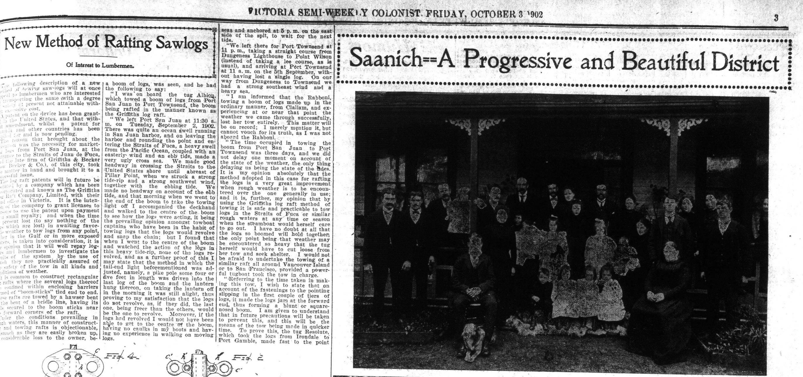
THE OLDEST INHABITANT OF SAANICH AND MEMBERS OF HIS FAMILY.

In combination with means gs or the like to the line les thereof, the log connecsposed in pairs for the purh. Another Story About the Blowing up of the Maine. Another Story About the Blowing up of the ship to be defective electric wireless the story and the led his friends to suppose that he knew the real cause of the destruction of the ship to be defective electric wireless that the Savarage and the lead has been considered to the ship to be defective electric wireless than the savarage and the line line less thereof, the log connection of the ship to be defective electric wireless than the savarage and the line line less thereof, the log connection of the savarage and the less than the savarage and the less thereof, the log connection of the savarage and the less than the less thereof and the less thereof are the log connection.