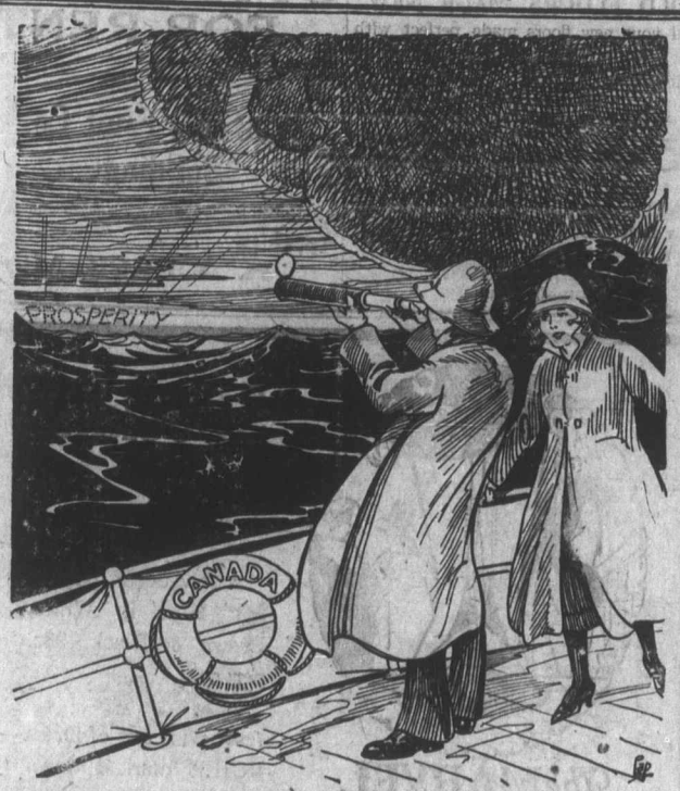
Miss Canada-It's Clearing Up Captain. Captain-It always does