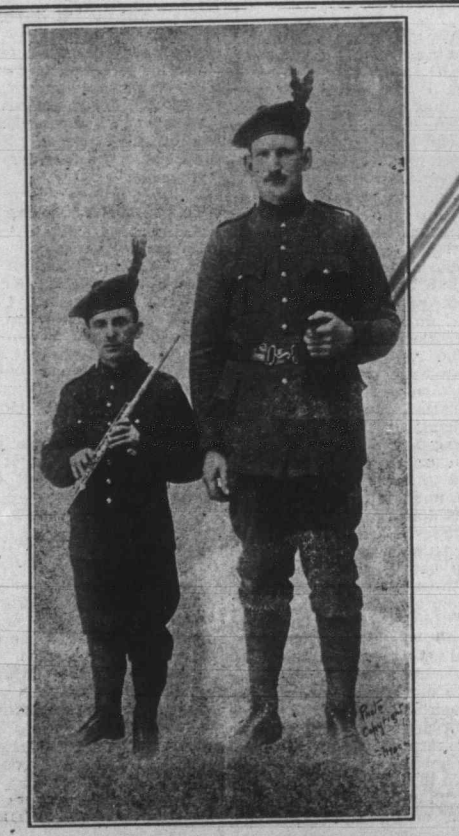
The Long and Short of the 85th Battallion, Nova Scotia Highlanders.