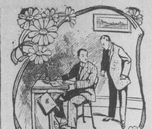
A Well Equipped Office

means on office the at uses "Globe-Wernicke" Filing Cabinets and "Safe guard" Methods of Indexing. These modern aids add to the comfort and convenience of those employed and increase the efficiency and speed of your office force.