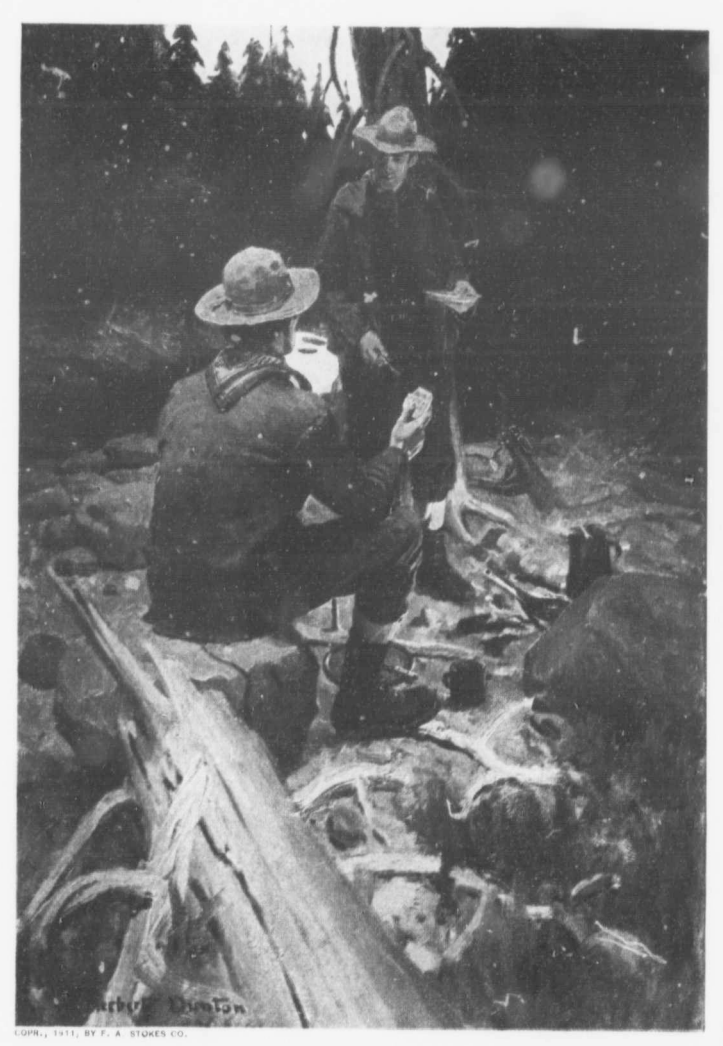
"THEY HAVE IMBIBED THE PRISTINE VIGOR OF THE WILDERNESS" -Page\ 199