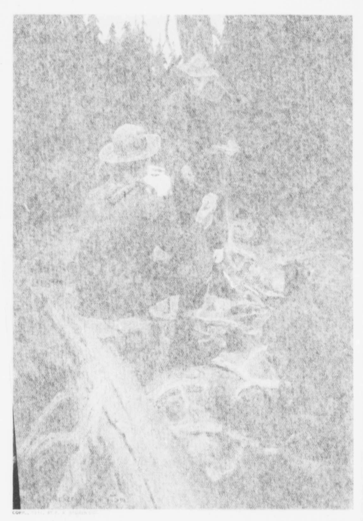
"THEY PLAYS IMBURED THE PRISTING VIGOR OF THE WILDERNESS" -Page~199