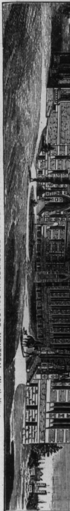
THE DAVID MORRICE HALL AND LIBRARY—PRESBYTERIAN COLLEGE, MONTREAL—(North View.)

N.B.—Bequests of real estate to be valid require to be made at least six months prior to the death of the testator.