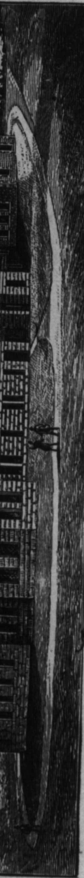
THE DAVID MORRICE HALL AND LIBRARY—PRESBYTERIAN COLLEGE, MONTREAL—(South View)