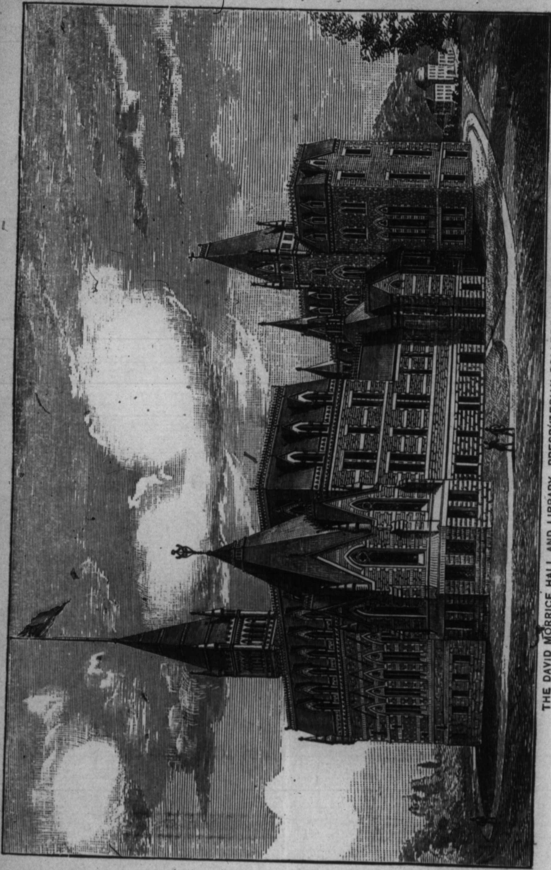
THE DAVID MORRICE HALL AND LIBRARY—PRESBYTERIAN COLLEGE, MONTREAL—(South View )