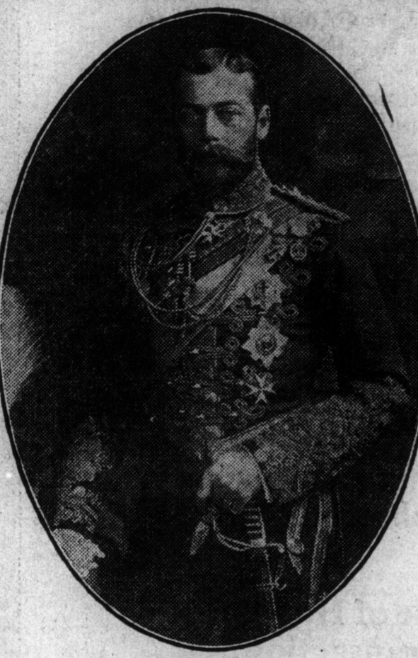
KING GEORGE V.

The greatest moving picture in the world