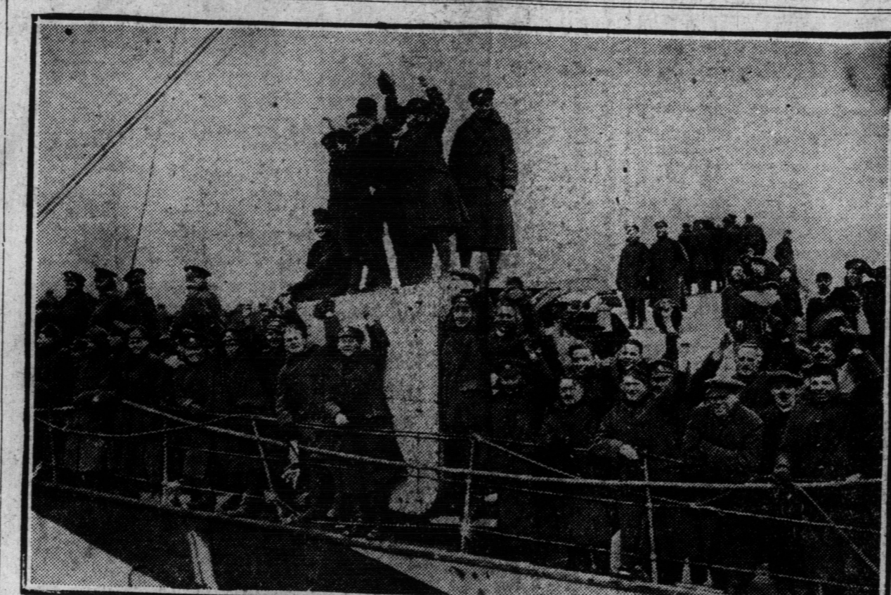
Canada looks good after years spent fighting in Europe. This is how the boys greeted Halifax when the Olympic drew into the harbor.