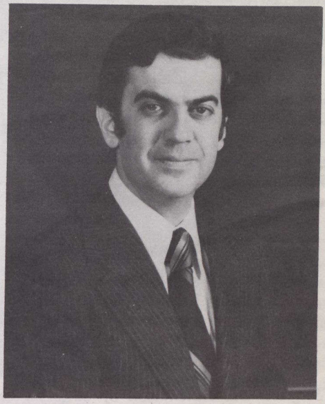
Minister of Regional Economic Expansion Pierre De Bané.

During the 12-day visit, Mr. De Bané also met with 26 ministers of different and with a number of local officials