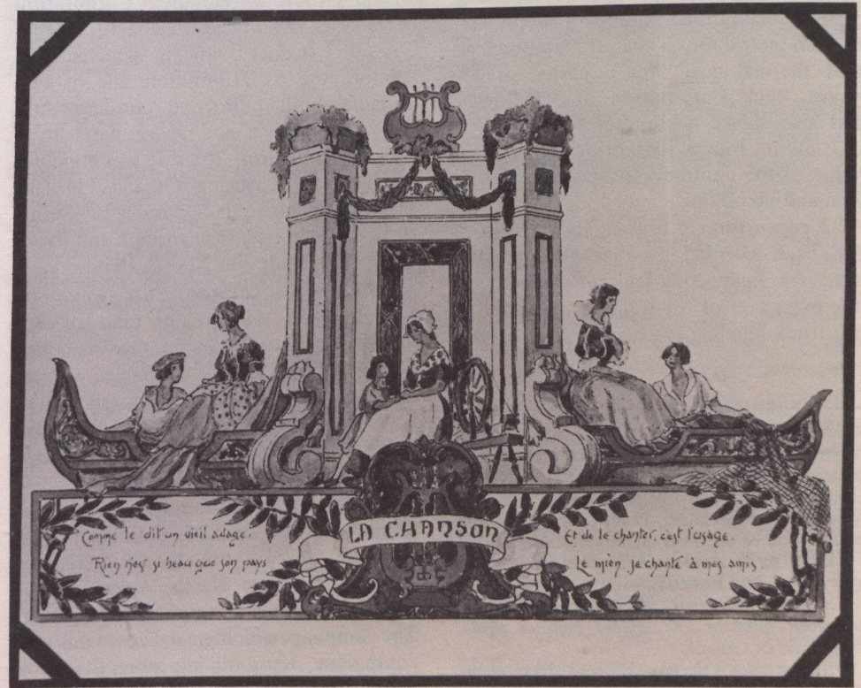
Drawing by Jean-Baptiste Lagassé of a float for a parade.

One highlight of the exhibition is a presentation of photographs from 1928 documenting the Saint-Jean-Baptiste Parade of that year, when the theme of each float centered around one specific song.