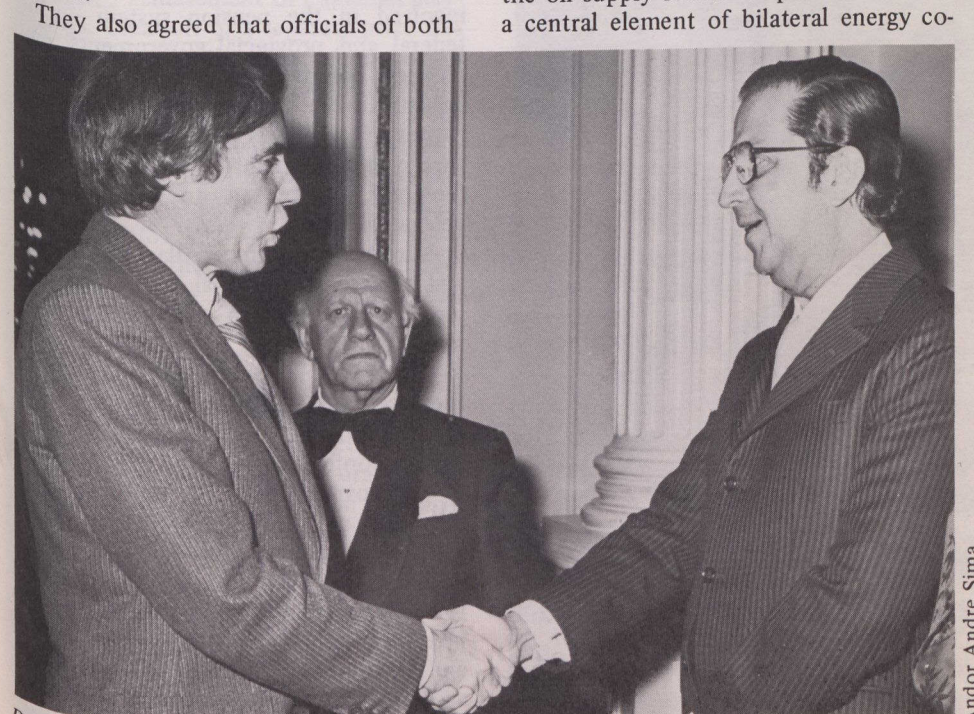
Dr. MacGuigan greets Dr. Zambrano-Velasco at a reception in Ottawa.

The two ministers exchanged views regarding the North-South dialogue and agreed that both countries would make every effort to bring the dialogue to a successful conclusion. They also reaffirmed their strong support for the United Nations and the principles of the United Nations charter and agreed that all members must make greater efforts to strengthen its effectiveness.