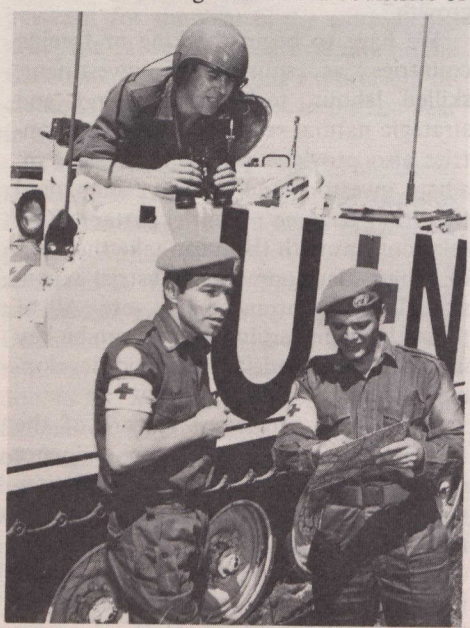
Canada's internationalist tradition in cludes activities such as peacekeeping.

As a basic instrument of its global, differentiated foreign policy, the government has therefore decided to give concentrated attention to a select number of countries of concentration. The purpose is generally to strengthen long-term relationships with these countries because of their relevance to our long-term domestic development objectives. But the importance of the countries in question would also devolve from their relevance to our over-all objectives and interests. Such a list would include both long-established countries of