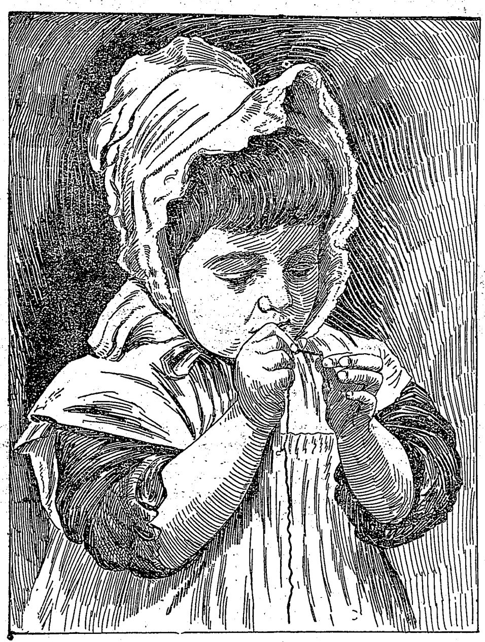
THREADING MOTHER'S NEEDLES.

and many times she would spare how she could best help those mother's steps by running to do some little errand for her.