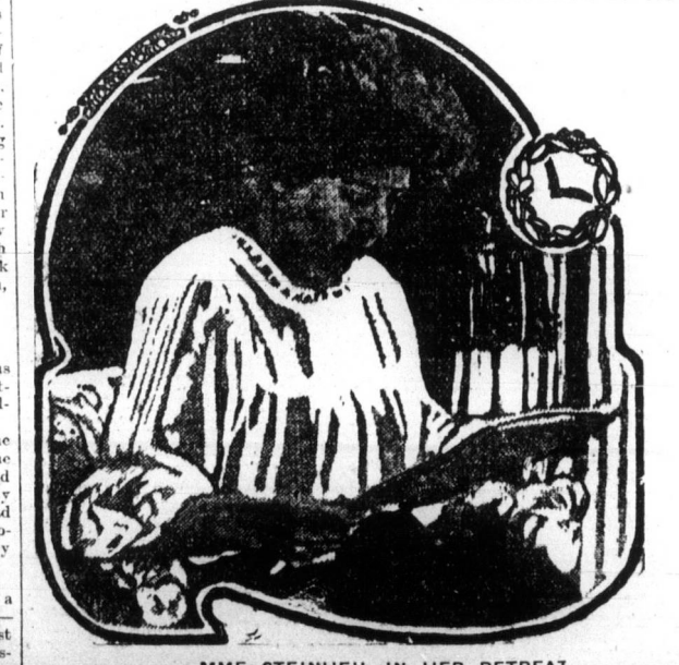
MME. STEINHEIL IN HER RETREAT.