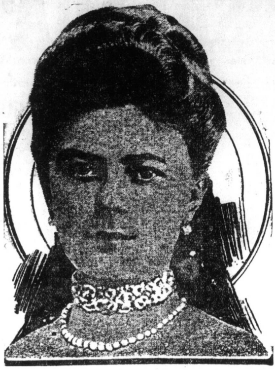
PRINCESS CHOTEK, WHO PLANS TO BE AUSTRIA'S EMPRESS.