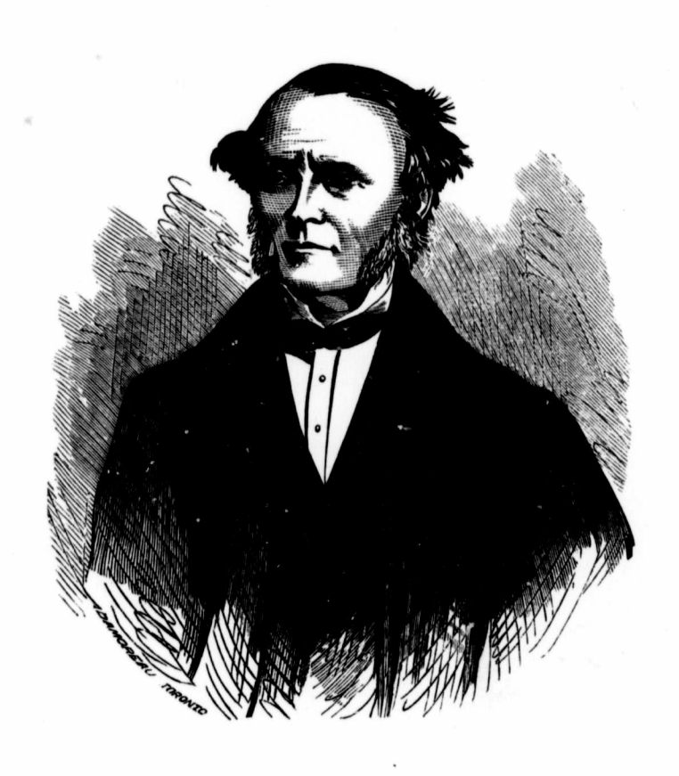
THE HON. JOHN SANDFIELD MACDONALD.