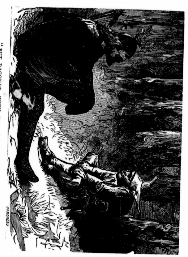
"BUT DAGONET, WITH ONE FOOT POISED IN HIS HAND."