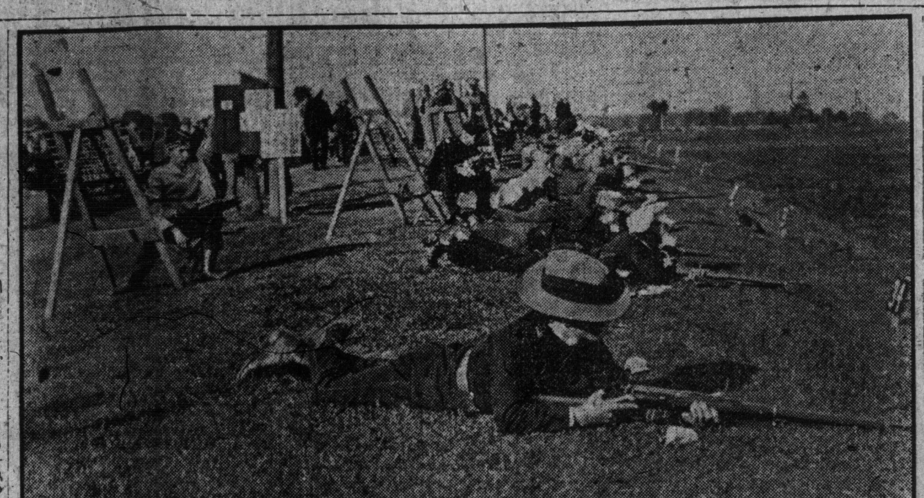
AT THE LONG BRANCH RANGES, where the Ontario Rifle Association Annual Matches are now in progress Marksmen are here from coast to coast, and even from New South Wales, Australia

wind marksmanship, and some of them made splendid scores. An ordinary breeze blows them straight out, and a marksman can