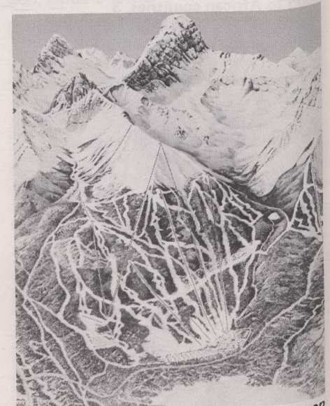
The alpine ski events will take place of Mount Sparrowhawk.

Located close to Banff, Radium, Lake Louise, Waterton and other mountain resorts, Calgary offers abundant outdoor recreation within easy reach: hiking, swimming, golfing, fishing and skiing. The Calgary Stampede, an internationally famous rodeo, attracts thousands of tourists to the city each year.