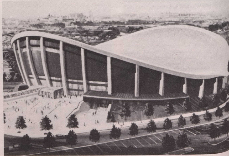
An artist's concept of the Olympic Coliseum, which will seat 18,000.