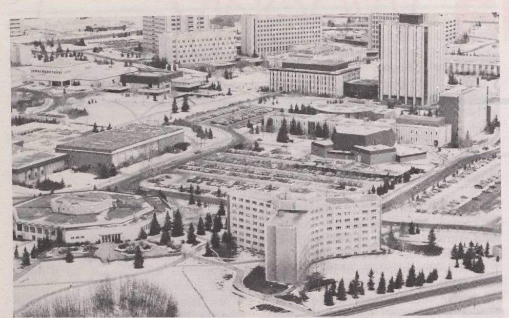
A view of the University of Calgary where the Olympic Village will be located

was initially established as a fort by a contingent of North West Mounted Police in 1875.