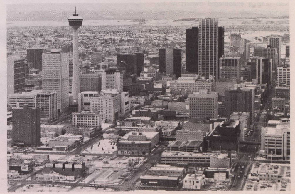
A view of Calgary, the site of the 1988 Winter Olympic Games.

Calgary is a comparatively young city compared to other cities in Canada. It