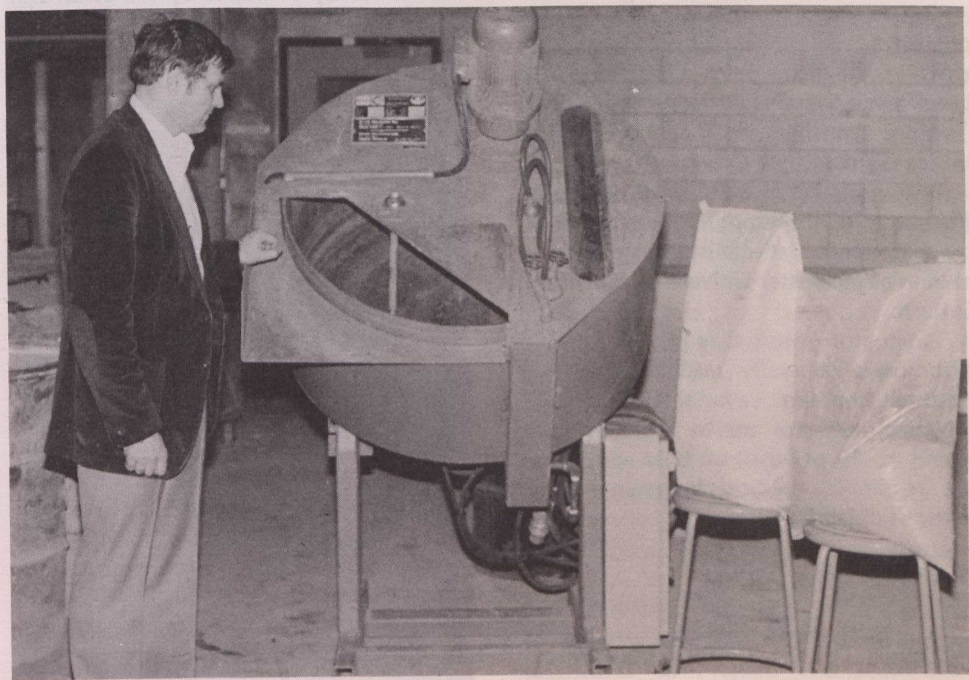
By the addition of a small amount of a binding agent, silica dust can be transformed into granules that are easily transportable in bulk. The photo is of Pierre-Claude Aıtcin, a professor at the University of Sherbrooke in Quebec.

The two researchers developed a method of granulation based upon the addition of a small amount of a binding agent which creates granules that can be transported in bulk and are sufficiently solid that they can be handled without special precautions.