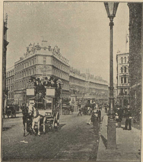
FLEET STREET, LONDON.

them on the pinnacles, forming prisms and separating the rays of light into a thousand colors, while the crevices formed deep shadows as a background, making the scintillating jets of light more luminous. Its radiance was strong and clear, but at the same time singularly soft and spiritual—it seemed a part of some enchanted land. At noon a strange phenomenon occurred. A small cloud, not bigger than a man's hand, formed over the largest of the icebergs. It increased in size, and remained over the ice-mountain for several hours. A beautiful rainbow was formed, whose colors were reflected and refracted from the "glittering bergs of ice" with a splendour that was dazzling. When daylight passed away the moon rose up behind the pinnacles of sky-piercing fingers of crystal ice; a rich greenish radiance sprang into the sky from behind the ice-mountain, vast radiating bars, broad fan-shaped shadows. It was a spectacle to take one's breath away, for the wonder of it and the sublimity.